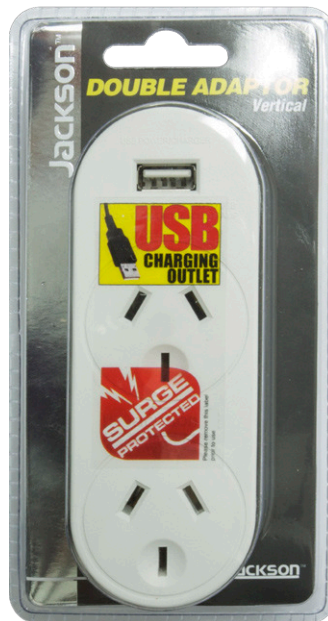
PT6366: Vertical + USB Charging outlet